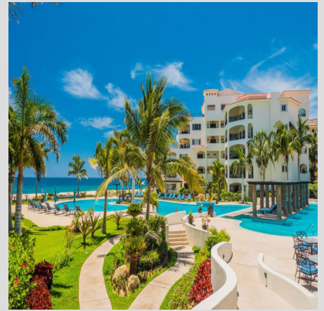
Zona Hotelera San José Del Cabo, Los Cabos, Baja California Sur