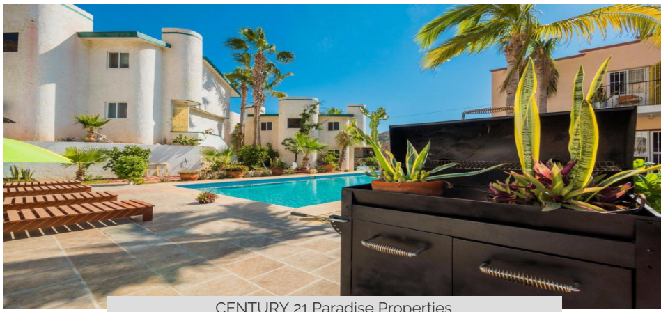
CENTURY 21 Paradise Properties

Lomas Altas, Los Cabos, Baja California Sur