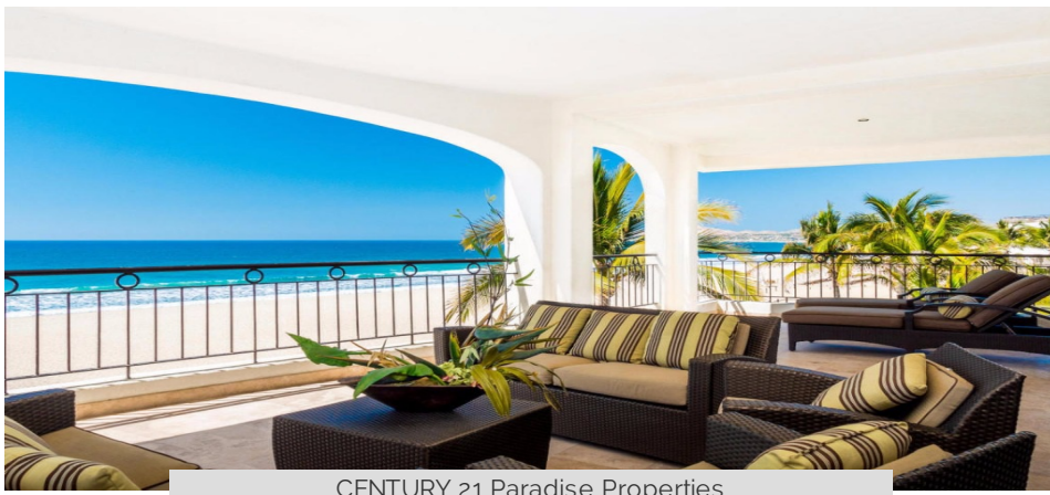
CENTURY 21 Paradise Properties

Zona Hotelera San José Del Cabo, Los Cabos, Baja California Sur